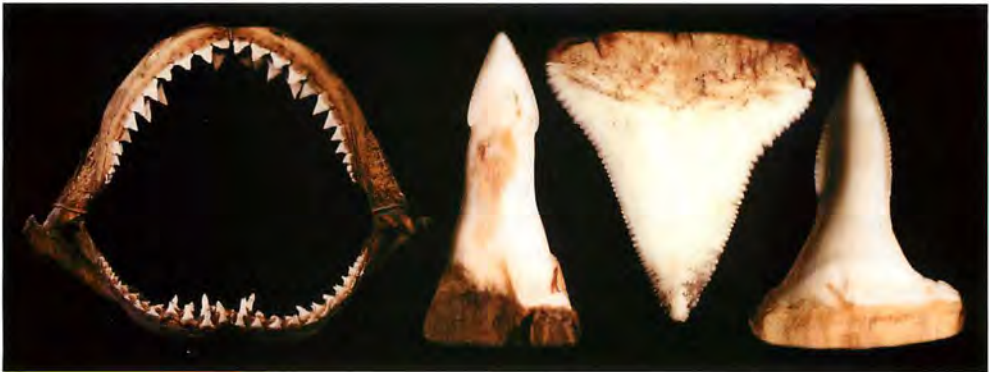
Figure 2. Glyphis glyphis from Pulo Condor, jaws and teeth (ZMH 14850).