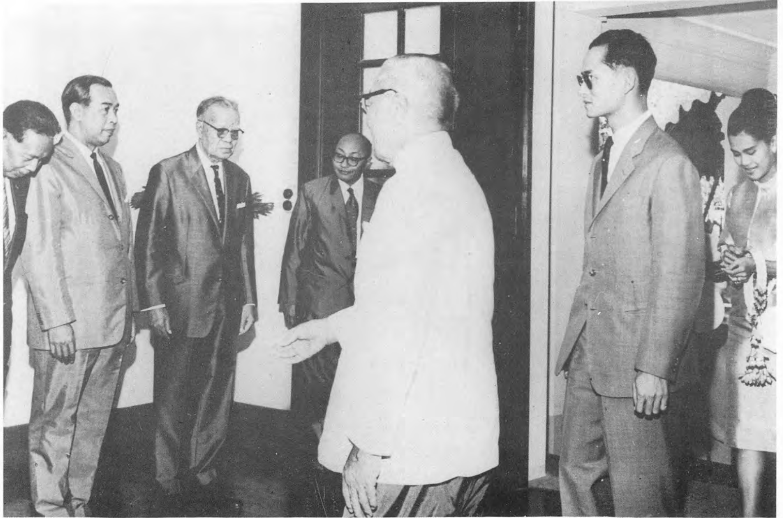
Their Majesties the King and Queen visited The Society on its 50 th anniversary in 1954