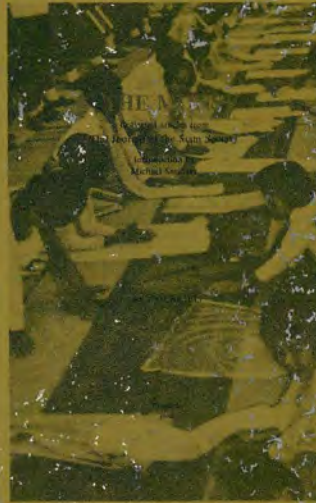
The Mons – Collected Articles